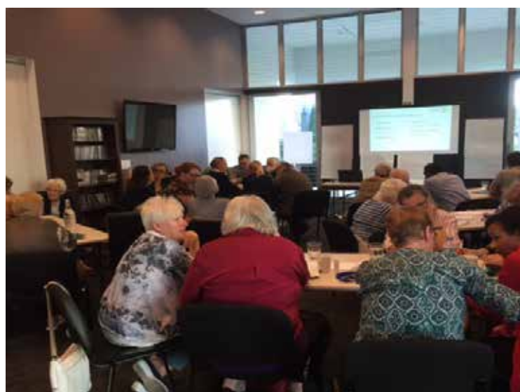
Dandenong Regional Training

"A good reminder that being a Director is a role too. It isn't just about the office bearer role that often goes along with being a director."