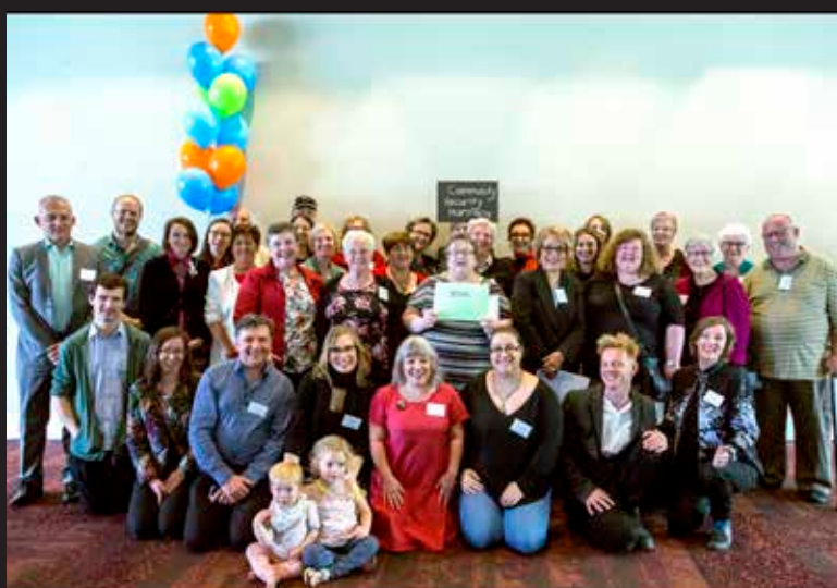
2010+ COMMUNITY - SECURITY - HARMONY