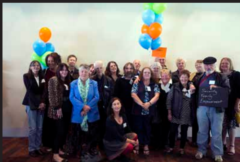
1990'S SECURITY - FAMILY - EMPOWERMENT

At the 30 Year Celebration in November 2016 co-op members were asked to sum up their decade, captioned here under each photo. Relive the 30 Year celebration by watching stories from members www.cehl.com.au/video