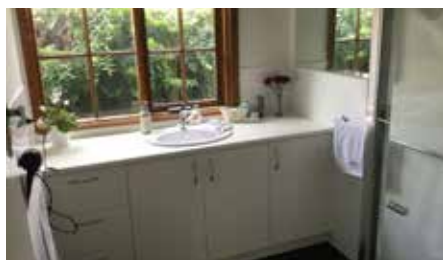
AFTER: larger vanity, replace bath with new shower