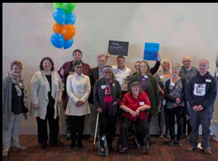
before + 1980'S TRAILBLAZERS