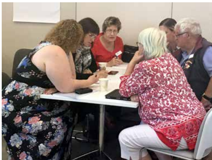
Metro West Regional Training