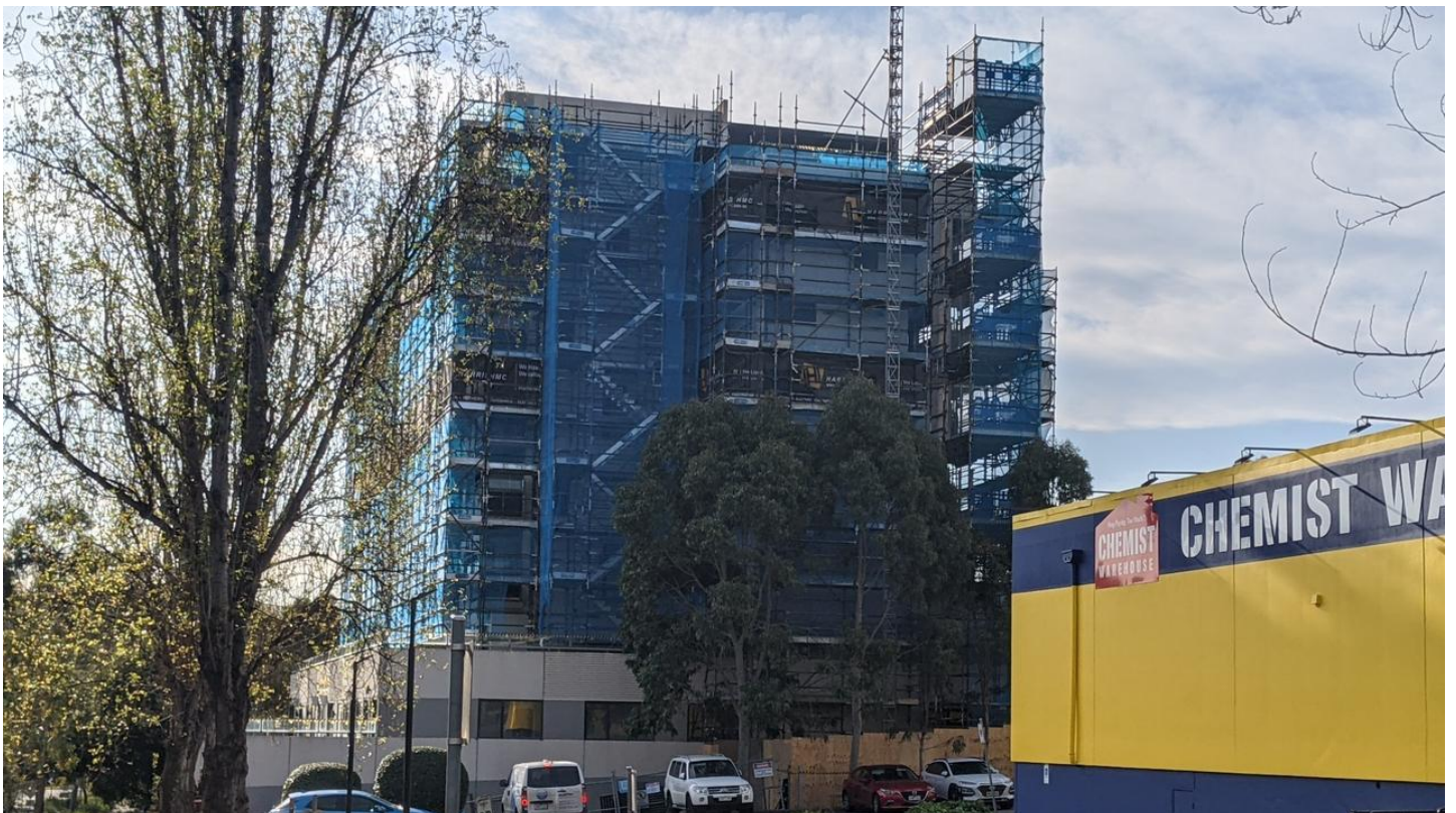
Construction is in full swing for the redevelopment of Ringwood's Lakewood social housing complex on Larissa Ave.