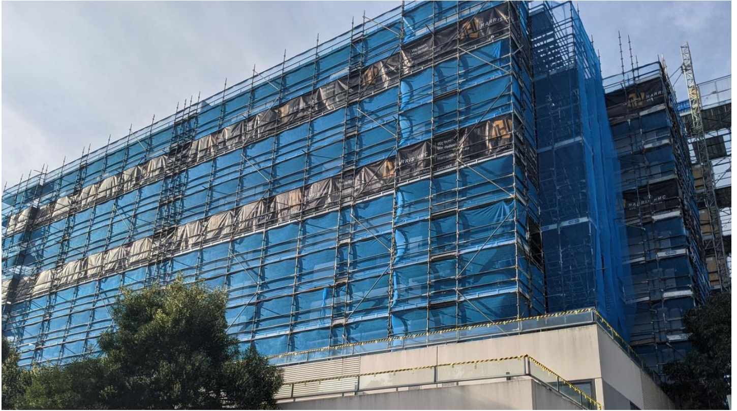
Ringwood's Lakewood social housing complex is undergoing a complete overhaul.

Residents were relocated to nearby temporary housing late last year, and most were set to move back when construction finishes depending on personal circumstances.